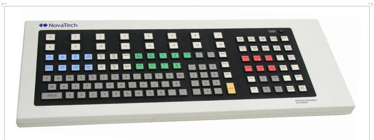
D/3 USB Keyboard

See Operator Console User's Guide for additional information about the D/3 Keyboard functions.